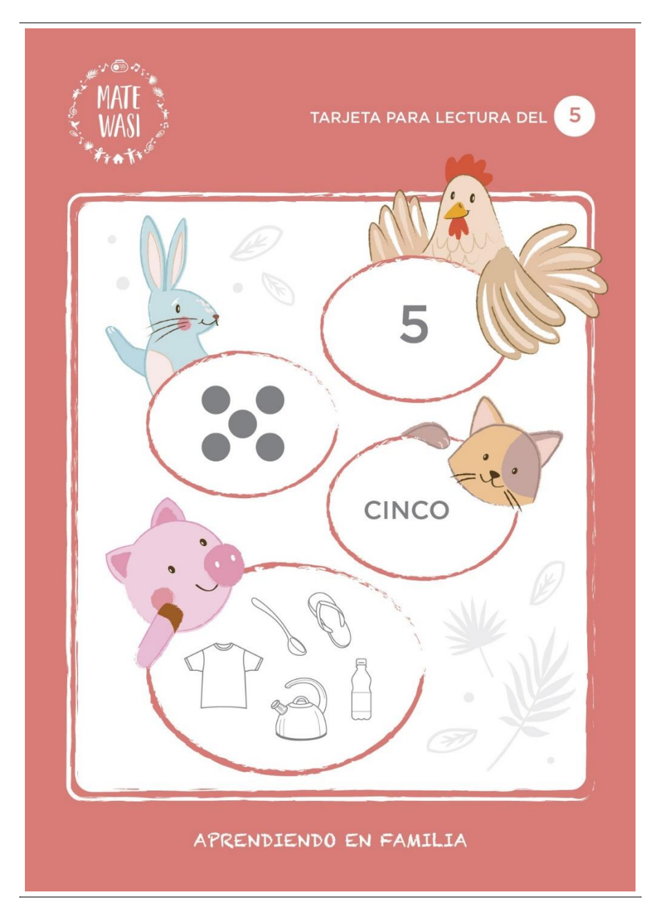
Figure A.1: MateWasi material example: Card 5