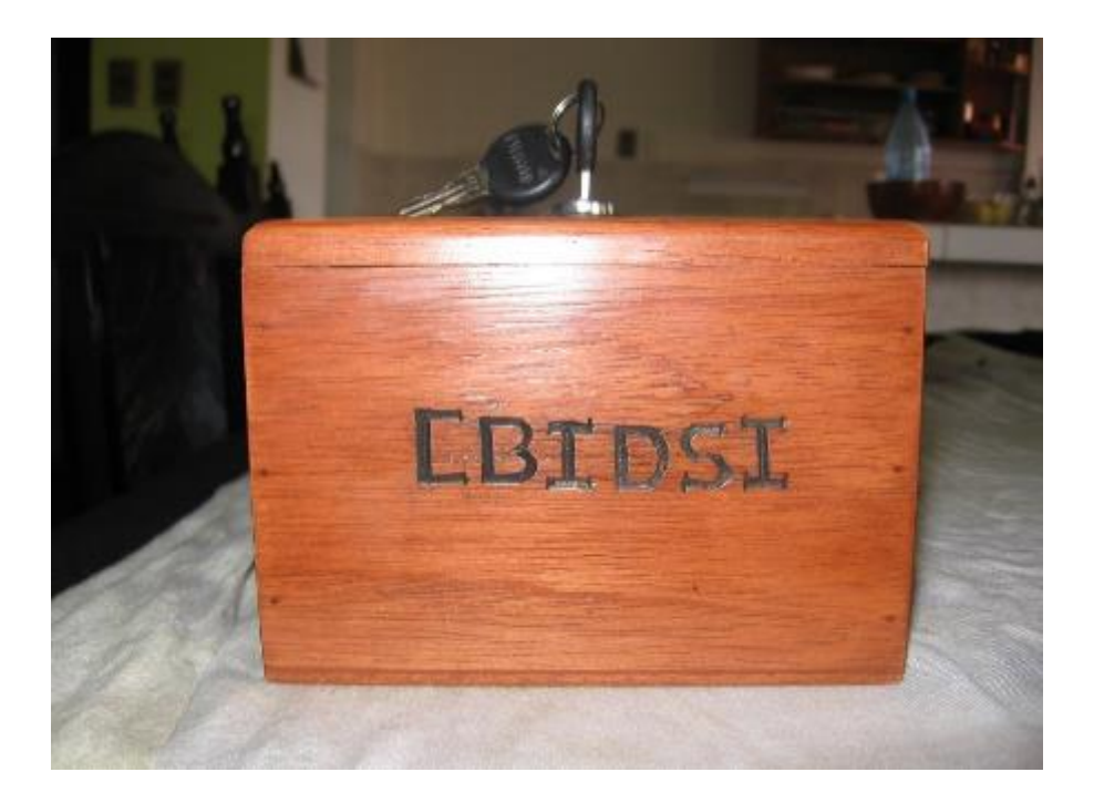
Appendix B. Photo of savings box