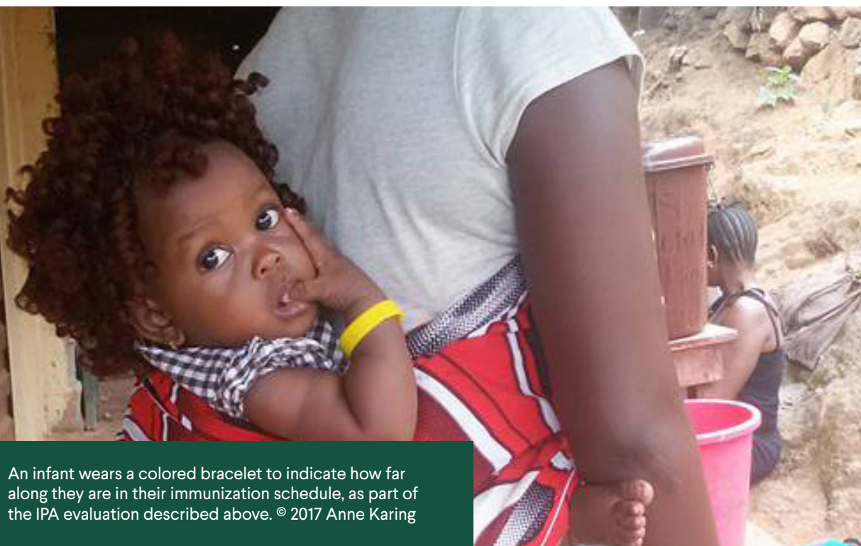
An infant wears a colored bracelet to indicate how far along they are in their immunization schedule, as part of the IPA evaluation described above.

In another example, we are currently working with the Sierra Leone Ministry of Health to expand an immunization demand program across the country. IPA and researcher Anne Karing conducted a trial in Sierra Leone that found that a colored bracelet worn by a child—signaling how far along the child is in completing their immunization schedule—increased timely and complete vaccination by 13.3 percentage points at a cost of less than US$1 per child. We are currently evaluating the value of additional bracelets to signal the initiation of the new malaria vaccine series and completion of the full routine immunization schedule and testing cell phone reminders to encourage vaccinations.