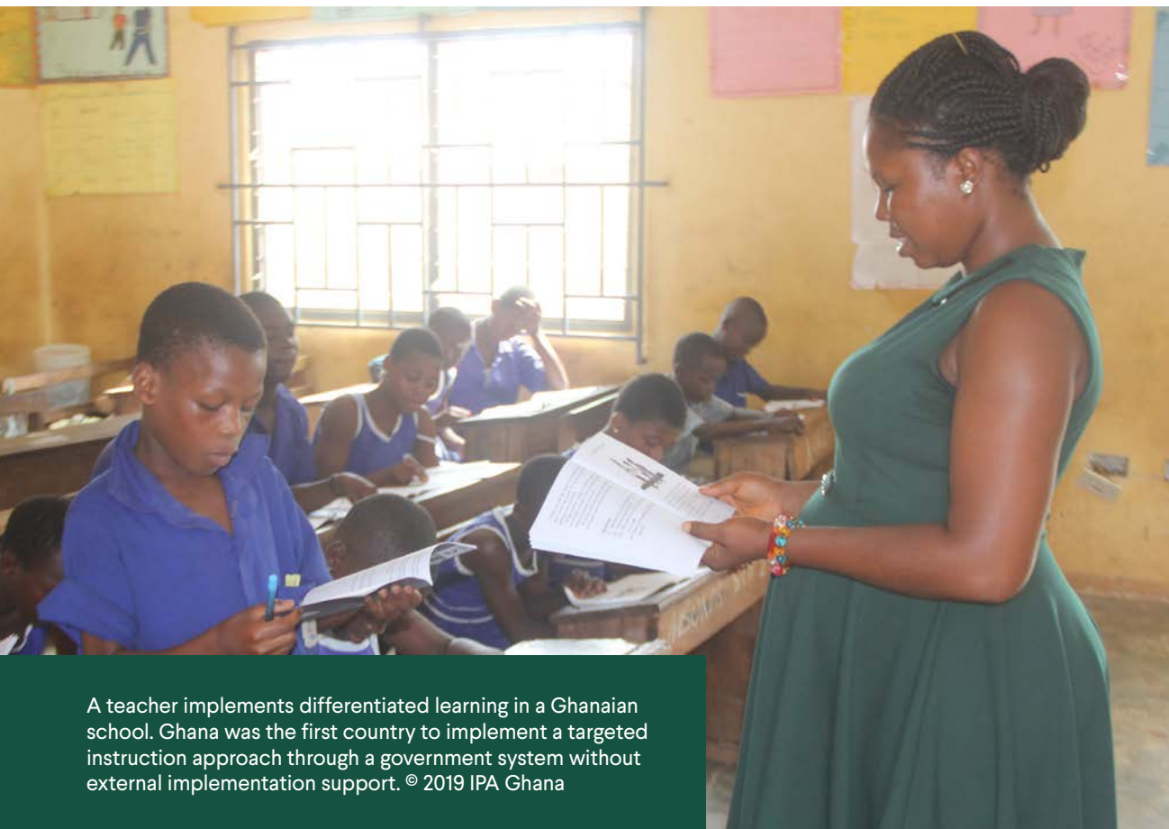
A teacher implements differentiated learning in a Ghanaian school. Ghana was the first country to implement a targeted instruction approach through a government system without external implementation support.

To increase the sustainability and longevity of the program, we further evaluated cost-effective ways to provide refresher training for teachers, comparing digital and in-person methods, to enhance quality implementation of the program. We are also integrating differentiated learning indicators into the government's monitoring, evaluation and learning (MEL) systems, including developing monitoring forms to track progress and inform improvements. IPA is mentoring the Ghana Education Service (GES) staff on how to conduct training evaluations, data collection, and MEL to ensure they can continue these activities independently.