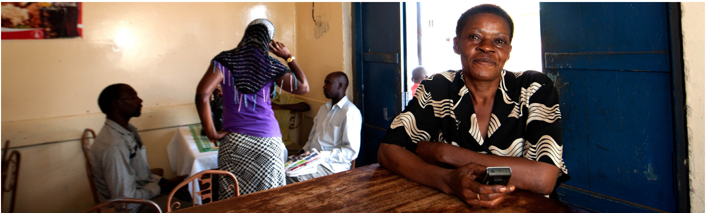
A mobile banking customer with her phone in Uganda.

Innovations for Poverty Action (IPA) is a global research and policy nonprofit that discovers and advances what works to improve the lives of people living in poverty. IPA tests promising ideas across contexts and along the path to scale, proactively engages key decision-makers throughout the research process, shares findings with the right people at the right time, and equips partners with the skills and tools they need to use data and evidence. Since our founding in 2002, we have worked with over 600 leading academics to conduct more than 900 evaluations in 52 countries. This research has informed hundreds of successful programs that now impact hundreds of millions of lives worldwide.