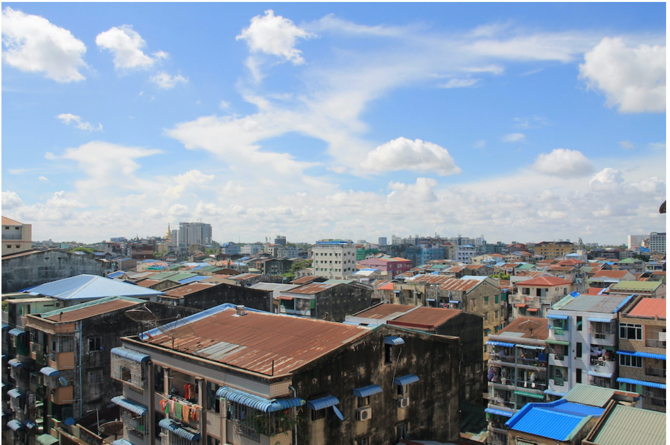
Yangon skyline with the IPA Myanmar office in the distance.

This diverse portfolio brought over 30 researchers to start or expand their projects in Myanmar, including some of the first randomized evaluations in the country. They collaborated closely with IPA to design rigorous research studies, implement effective data collection methods for hard-to-reach populations, and produce high-quality data. Additionally, the office played a key role in establishing an evidence-to-impact ecosystem; pioneering high-quality large-scale remote phone surveys; and building partnerships between researchers, donors, policymakers, and practitioners. As Mun Pan Aung, the Research and Business Development Manager, reflects, "We prioritized the uptake of research findings and our team is proud of producing the highest quality data to inform our partners' programs and policy decisions."