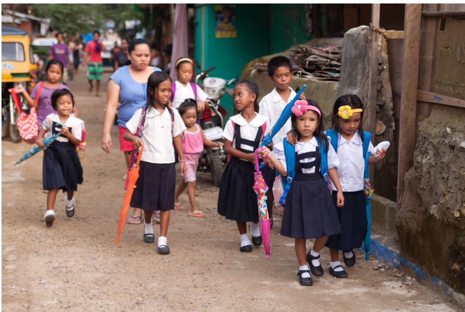
Children going to school at El Nido village, Palawan Philippines