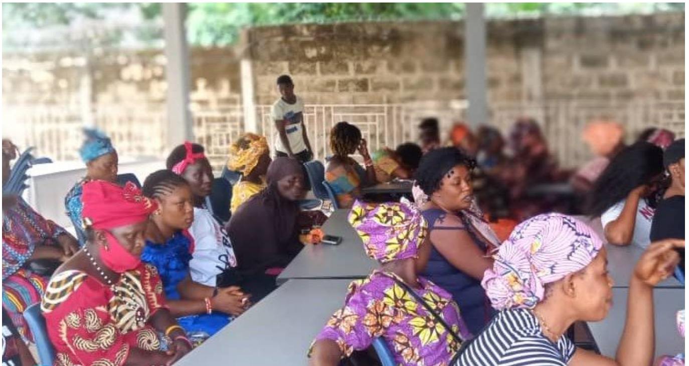
A group of women in Sierra Leone interviewed during the research process.

This piece was first published on the blog of the United Nations Capital Development Fund (UNCDF) here .