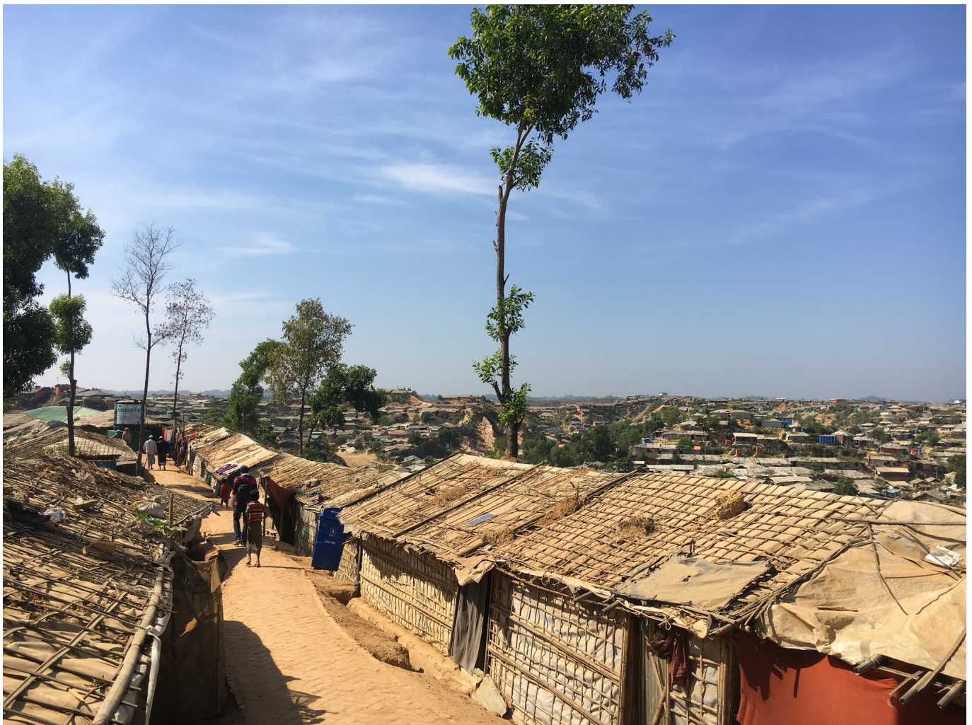
Hakimpara refugee camp in Bangladesh.

The world now has over 70 million forcibly displaced people. This is the highest absolute number in history, and the proportion of displaced people has risen by a dramatic 48 percent in recent years—from about 1 in every 160 people in 2009 to 1 in every 108 people today,