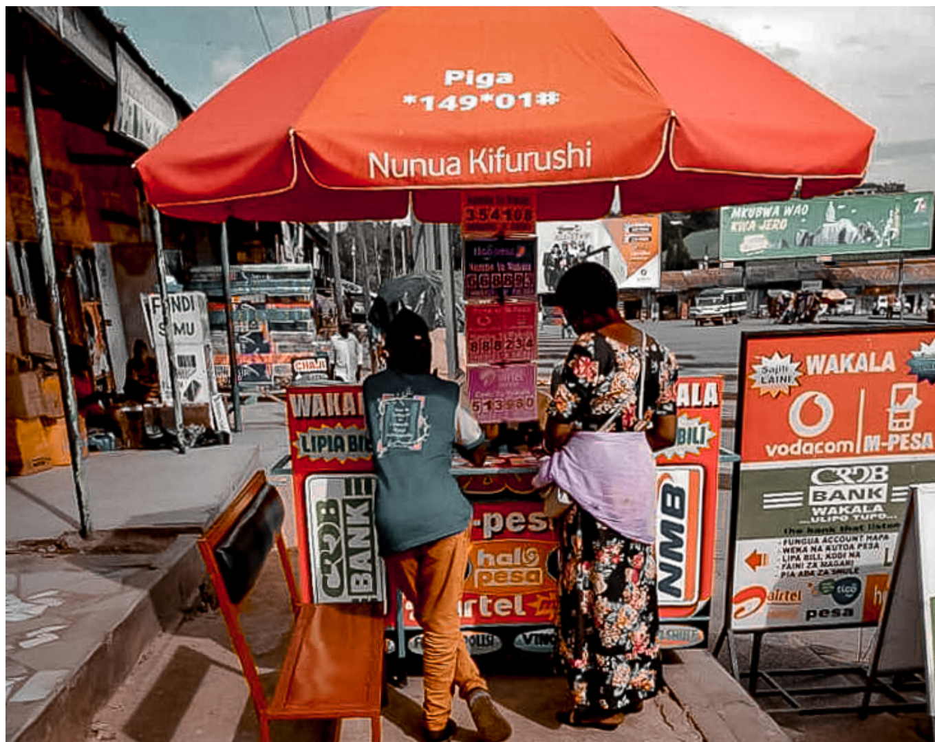
In This Image

A woman at a mobile money vendor in Tanzania